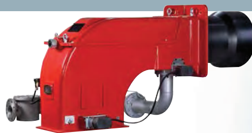
TLX gas series LOW NOx